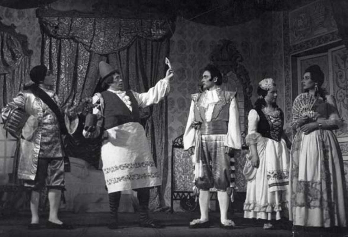
Figaro pulm, Vanemuine 1950, lavastaja Kaarel Ird